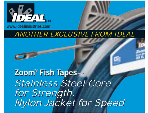
Circle 101 on Reader Service Card